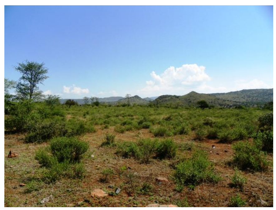
FIGURE 5: Proposed substation site 2