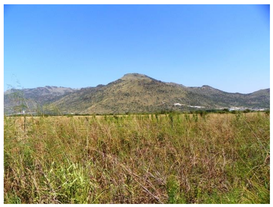
FIGURE 3: Proposed substation site 1