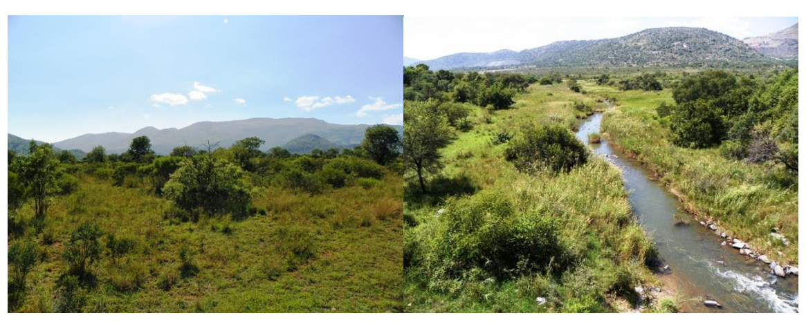
FIGURE 2: Photographs of the micro habitats available to avifauna in the study area

The most sensitive of these micro habitats, from a collision perspective, are the wetland (including the rivers and drainage lines) and open grassland patches. TABLE 1 shows the micro habitats that each Red List bird species typically frequents in the study area. It must be stressed that birds can and will, by virtue of their mobility, utilise almost any areas in a landscape from time to time. However, the analysis below represents each species' most preferred or normal habitats. These locations are where most of the birds of that species will spend most of their time – so logically that is where impacts on those species will be most significant. TABLE 1 makes use of the authors' extensive experience gained through personal observations of the relevant bird species.