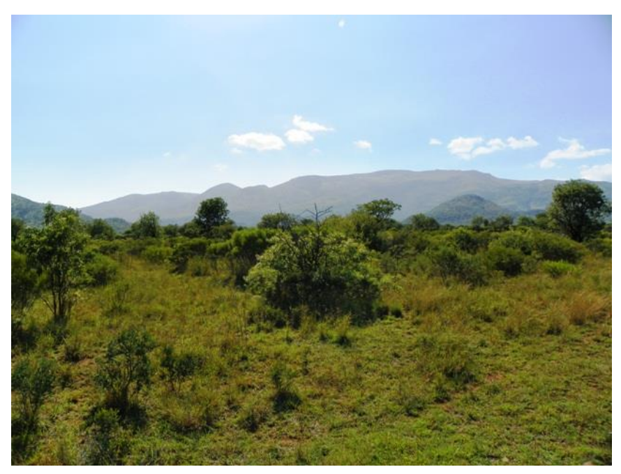
FIGURE 6: Proposed substation site 3